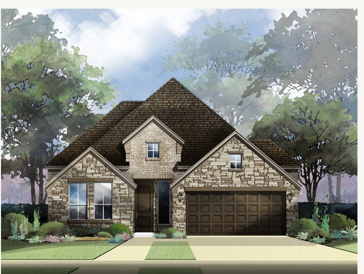
Elevation C Elevation D