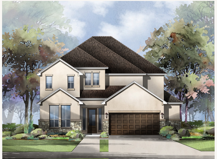
Elevation A w/ Storage